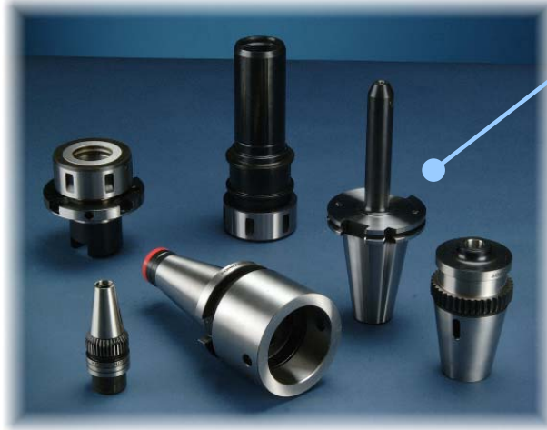
Typical special toolholders

Heat Shrink Front End Now Available on all Specials