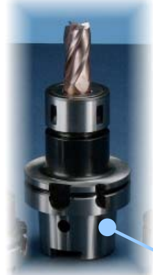
Special HSK All taper sizes

We can manufacture and gauge all taper types.