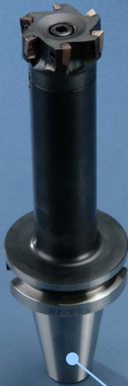
BT50 extended shell mill adapter

Heat Shrink Front End Now Available on all Specials